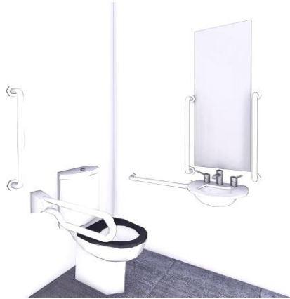
DISABLED PERSONS WASHROOM