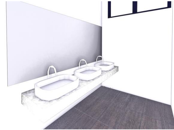
WASH HAND BASIN