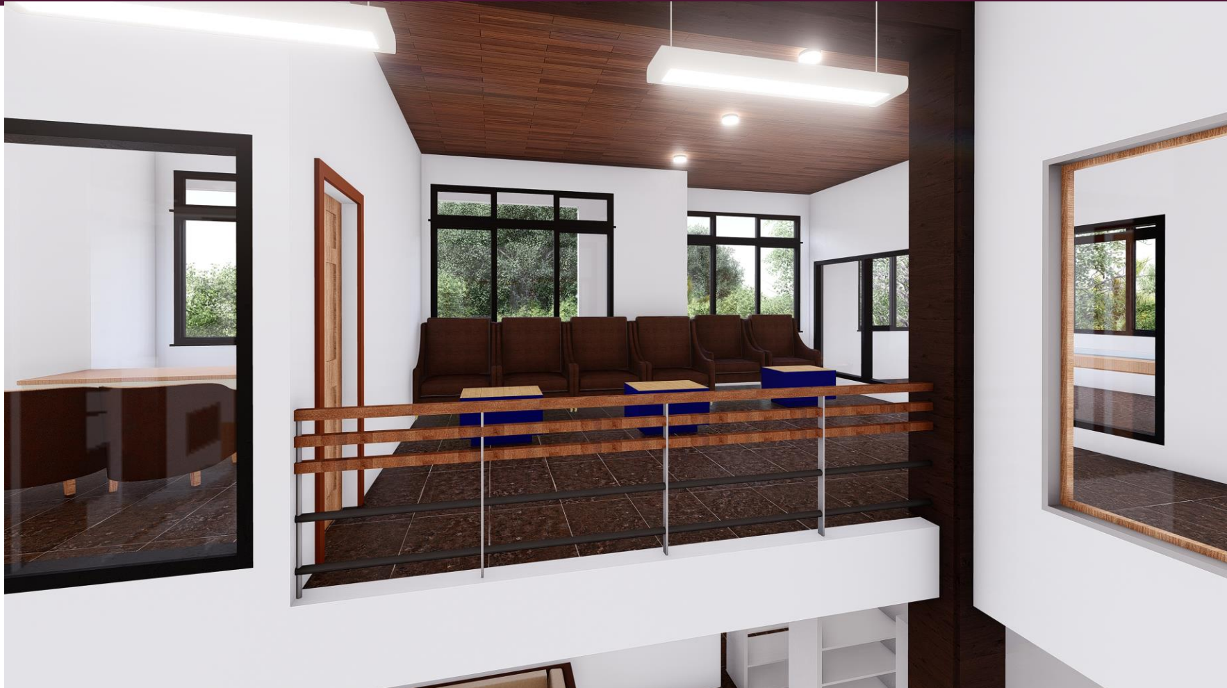
Waiting/ reading area